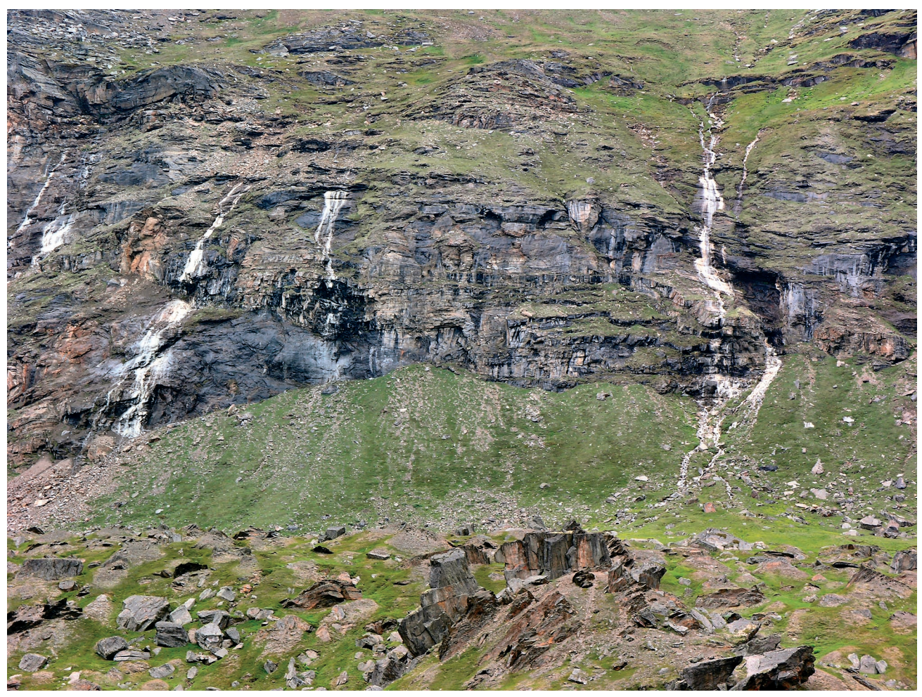
Fig. 1. View of eastern cliff face of Kärkevagge showing "white streaks" of efflorescence along stream courses