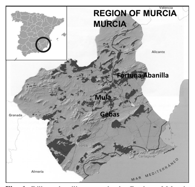
Fig. 1. Rills and gullies areas in the Region of Murcia

marls. Following a widespread marine regression, erosion processes formed exceptional badland areas as observed in the basins of Fortuna-Abanilla, Mula, or Gebas (Fig. 2).